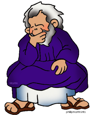
Rabban Yochanan Ben Zakkai