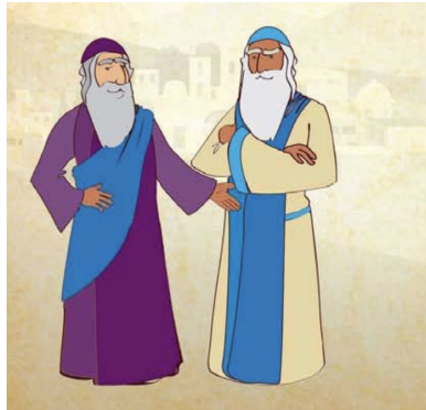
Yehoshua ben Perachiah and Nitai from Arbel