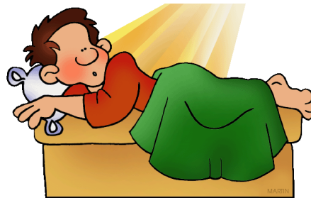
The Neviim (Prophets)