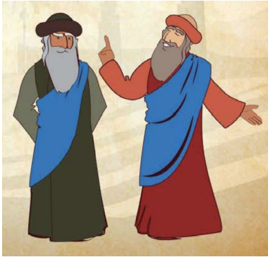
Yose ben Yoezer from Tsreida & Yose ben Yochanan from Jerusalem