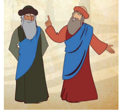
Yehuda ben Tabai and Shimon ben Shetach