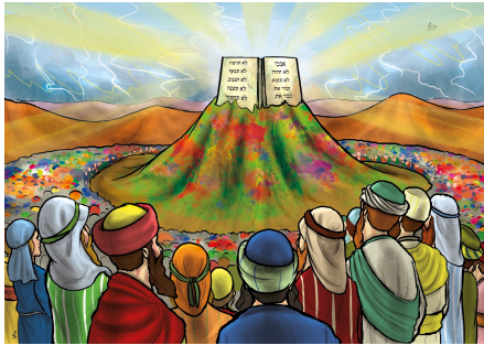
Hashem at Har Sinai

Props: Have the chanichim wear name tags of the people in the Shalsholet HaMesorah, the chain of passing down the Torah, while playing the game.