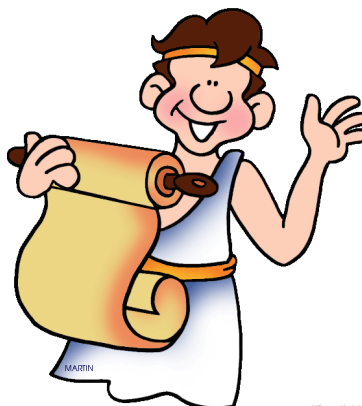
Antigonus from Socho