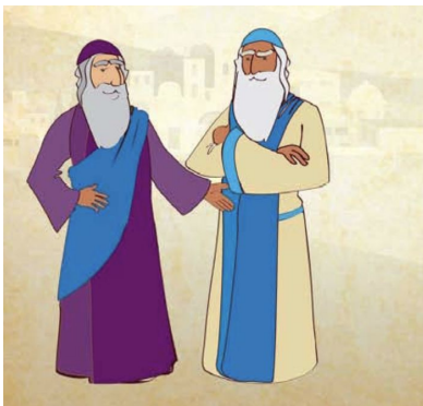
Shemayah and Avtalyon