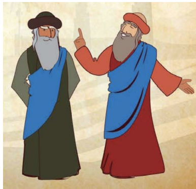
Hillel and Shammai