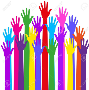
The 70 Zekenim